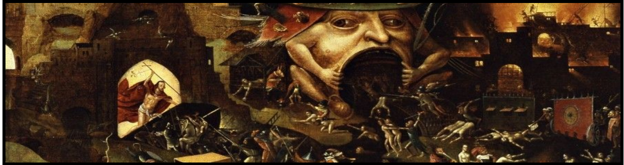
Christ in Limbo (Detail), Follower of Bosch c. 1575